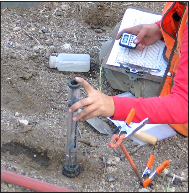
Figure 1: Using a mini-disk infiltrometer to assess soil burn severity and reduced infiltration after a fire.

Recently, Robichaud et al. (2008a) have developed a technique to use the hand-held Mini-disk Infiltrometer<sup>TM</sup> (MDI; Decagon Devices, Inc., Pullman, Washington) to sample infiltration to assess soil water repellency (Figure 1). A burned area sampling plan was developed specifically for BAER teams using the