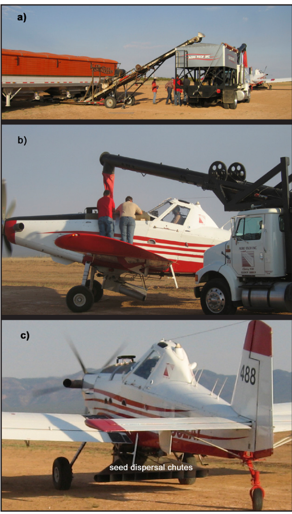
Figure 2: The staging area for aerial broadcast seeding treatment on 2400 ha burned at high and moderate burn severity on the 2008 Trigo Fire in New Mexico. a) Preparing the seed mix—50 % annual rye grass and 50 % native perennial (mountain brome and slender wheatgrass) by weight. b) Loading the seed mix into the seed hopper of the airplane. c) Airplane taxiing for take-off with seed dispersal chutes visible under the fuselage.

Treatment success depends not only on the treatment, but on the threat being treated. Until recently, broadcast seeding after fires was the most common and widely used post-fire erosion mitigation treatment (Figure 2) (Robichaud et al. 2000), and it is still extensively used in some regions. When the seeded plants