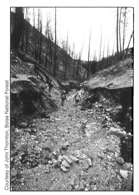
Figure 1. Headwater reach scour following wildfire on Boise National Forest.

Moderate. Moderate soil heating with moderate ground char; soil structure is usually not altered; decreased infiltration due to fire-induced water repellency may be observed; litter and duff are deeply charred or consumed; shallow light colored ash layer and burned roots and rhizomes are usually present; increase in runoff response may be moderate to high.