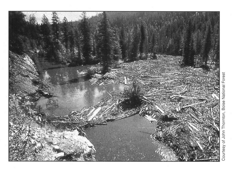
Figure 2. Downstream deposition of sediment and wood following wildfire in a reservoir watershed in the Boise National Forest.

functions of sediment storage, evapotranspiration, and shade may persist to some extent. Extensive wildfires that consume both upland and riparian sites create conditions conducive to severe hydrologic response. Although riparian areas appear less vulnerable to fire, some related research is equivocal (Everett et al. 2002), and there is substantial empirical evidence that severe wildfires can have major impacts on riparian areas.