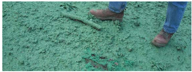
Aerially-applied hydromulch, while initially effective, did not provide lasting erosion protection after the first two or three summer rains.

Two application methods of hydromulch, ground-based with trucks and aerially applied with helicopters were also compared. Compared with the aerial hydromulch, the ground-based hydromulch had higher water content, did not include a PAM binding agent, and had a lower seed density. Visual observations indicated that aerial hydromulch had a much stronger and cohesive surface cover. Four pairs of treated and control plots showed that the ground-based hydromulching did not reduce sediment yields or revegetation rates relative to the adjacent control plots.