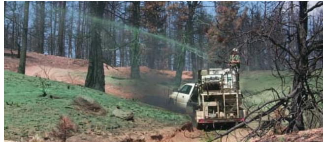
Ground-applied hydromulch was even less effective than aerially applied hydromulch. It did not contain a binding agent and was not effective in reducing sediment yields.

Two application methods of hydromulch, ground-based with trucks and aerially applied with helicopters were also compared. Compared with the aerial hydromulch, the ground-based hydromulch had higher water content, did not include a PAM binding agent, and had a lower seed density. Visual observations indicated that aerial hydromulch had a much stronger and cohesive surface cover. Four pairs of treated and control plots showed that the ground-based hydromulching did not reduce sediment yields or revegetation rates relative to the adjacent control plots.