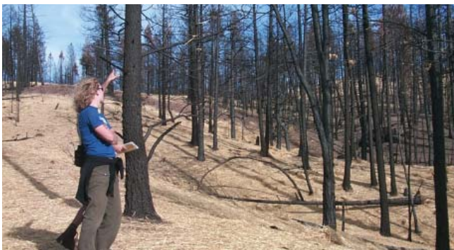
Of the various methods studied, aerially applied straw offered the best control of erosion.

a 70/30 mixture of barley and triticale seed applied at a rate of 70 pounds per acre, had some benefits during the first few rain events but then deteriorated and was washed downslope with subsequent rainfall events. Three years later, both types of mulch cover had deteriorated to the extent that there were no significant differences between treated and control sites.