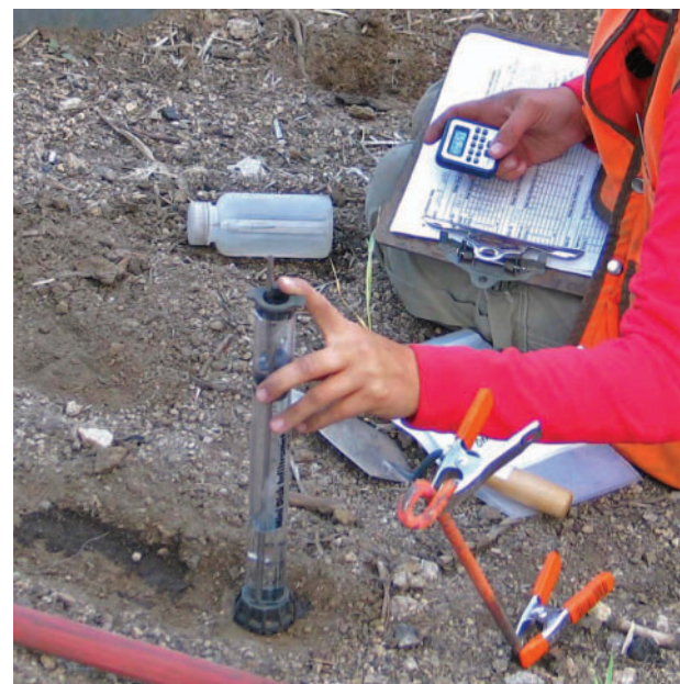
Fig. 2. Using the mini-disk infiltrometer in the field (from Robichaud et al. 2008).

The ease of using the MDI in the field has prompted ongoing efforts to correlate post-fire infiltration rates, as measured by rainfall simulation, to MDI measurements. Efforts to determine these correlations have been hindered by the large temporal and spatial variability of soil water repellency and post-fire infiltration rates as well as the relatively small number of post-fire