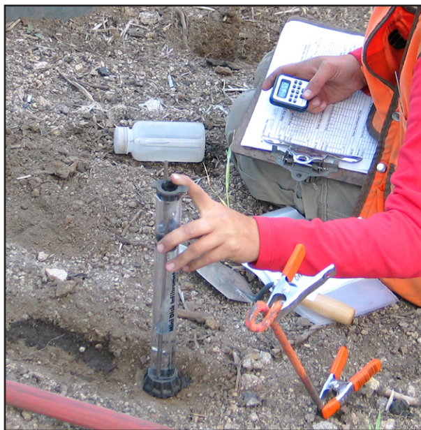
Figure 1: Using a mini-disk infiltrometer to assess soil burn severity and reduced infiltration after a fire.

Recently, Robichaud et al. (2008a) have developed a technique to use the hand-held Mini-disk Infiltrometer™ (MDI; Decagon Devices, Inc., Pullman, Washington) to sample infiltration to assess soil water repellency (Figure 1). A burned area sampling plan was developed specifically for BAER teams using the