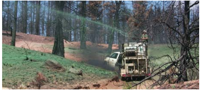
Ground-applied hydromulch was even less effective than aerially applied hydromulch. It did not contain a binding agent and was not effective in reducing sediment yields.

Two application methods of hydromulch, groundbased with trucks and aerially applied with helicopters were also compared. Compared with the aerial hydromulch, the ground-based hydromulch had higher water content, did not include a PAM binding agent, and had a lower seed density. Visual observations indicated that aerial hydromulch had a much stronger and cohesive surface cover. Four pairs of treated and control plots showed that the groundbased hydromulching did not reduce sediment yields or revegetation rates relative to the adjacent control plots.